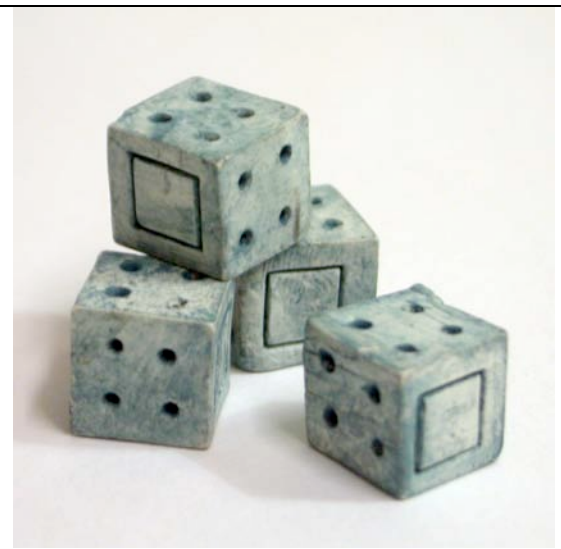
Special turn dice

Objective To be the first player to get four miniatures through the labyrinth.